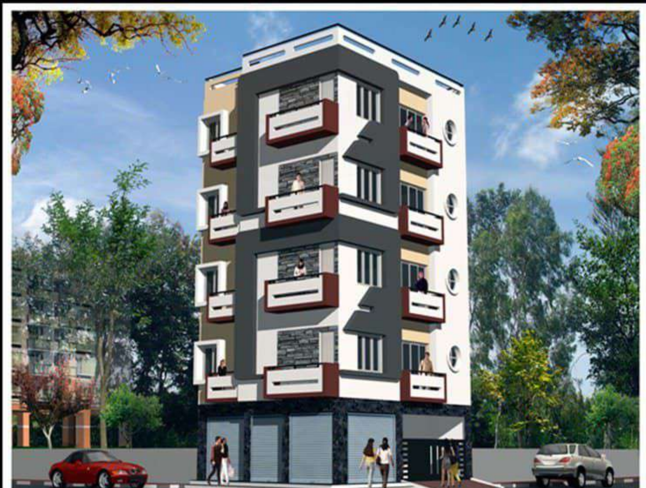
Aarzan Residency Arunachalam Mudaliar Road, Bangalore